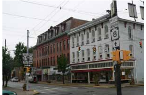
Titusville Historic District, Titusville, Crawford County.