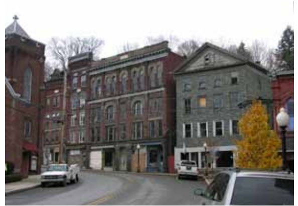
Susquehanna Depot, Susquehanna County.

These qualitative impacts are very much in line with the kinds of objectives being pursued by governments at all levels. As a result, historic preservation is increasingly understood in these terms, and there are many opportunities for collaboration across state and local agencies towards mutually desired ends, with historic preservation playing its role in stimulating economic development. In the report, "The Economic Benefits of Historic Preservation Activities in Pennsylvania," case studies on three communities within the Commonwealth (Phoenixville, Gettysburg, and Lewisburg) confirm that there are many ways to achieve these ends, using a combination of federal, state, and local initiatives and connecting to active local bodies and unique local assets.