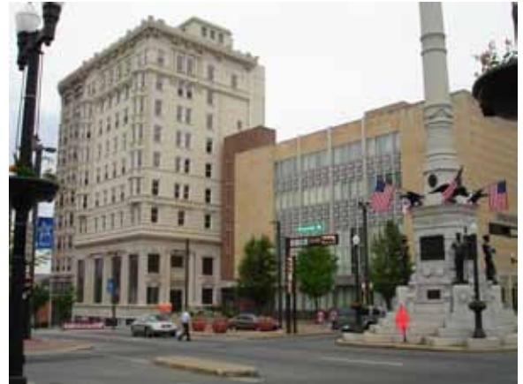
Allentown National Bank, Allentown, Lehigh County.

Similarly, the Commonwealth can help support local and regional efforts to bring tourists and their purchasing power into the Commonwealth, and related efforts to preserve and showcase the historic sites that draw them. Heritage tourism continues to grow, as people increasingly value unique and authentic experiences, and historic preservation safeguards the assets that make that possible, whether those assets are buildings, destination sites, or entire districts.