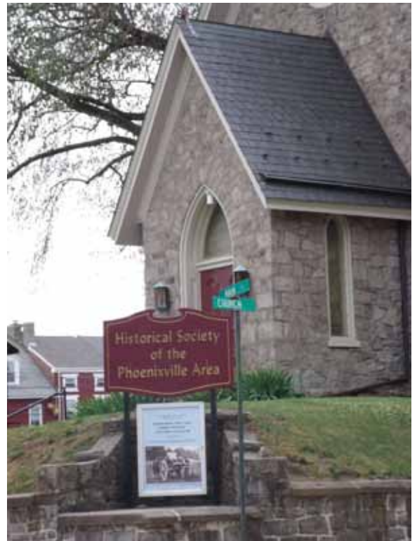
Phoenixville Historic District, Chester County.