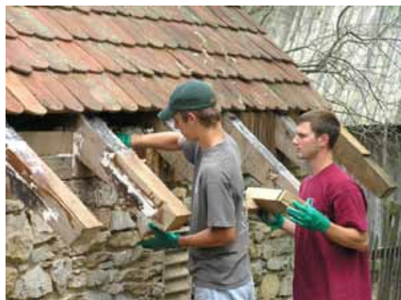
Landis Valley Farm Museum, Lancaster County.

In addition, at a time when many homeowners have negative equity and communities are negatively impacted by the spillover effect of foreclosures and disinvestment, the stabilizing and enhancing effect of historic designations can generate household wealth and prevent further distress in local housing markets.