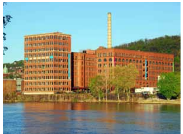
Armstrong Cork Factory, Pittsburgh, Allegheny County.