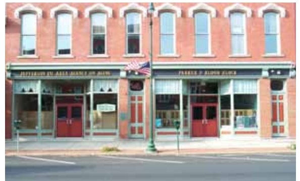
Brookville Historic District, Jefferson County.