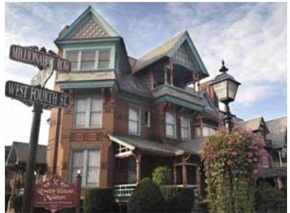
Rowley House Museum, Williamsport, Lycoming County.