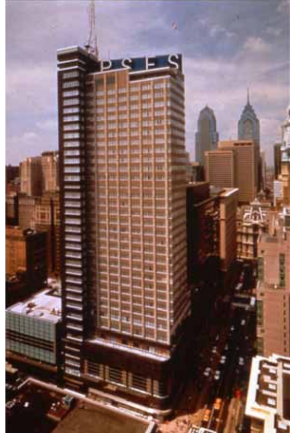
PSFS, Philadelphia.

In determining how to facilitate the most beneficial use of such a credit, so that the Commonwealth gains the most from the resulting federal contribution to local investment and from the economic impact of rehabilitation efforts, the example of other, successful states is instructive. Maryland's former Governor, Parris Glendening, led the way in re-engineering the historical preservation tax credit, leading to over $200 million in private investment and making the tax credit one of the state's most successful community revitalization tools. 6