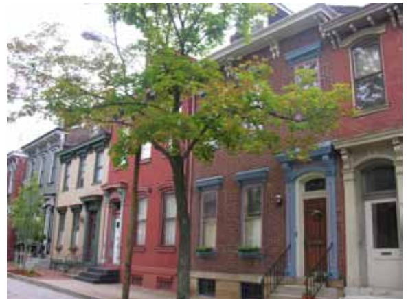
Mexican War Streets Historic District, Pittsburgh, Allegheny County.

Specifically, the Commonwealth has levers to encourage reinvestment in traditional central business districts and neighborhoods, to coordinate heritage tourism efforts, and to make available a state-level tax credit to further leverage federal dollars and private investment. If properly implemented, such measures will pay dividends to the Commonwealth not only in aesthetic, cultural, and historic terms, but also as it relates to job creation, economic activity, municipal revenues, and real estate conditions.