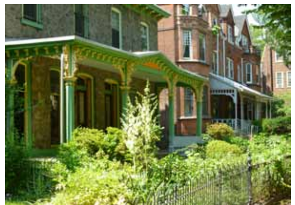
Powelton Village Historic District, Philadelphia.