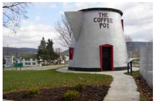
Koontz Koffee Pot, Bedford, Bedford County.