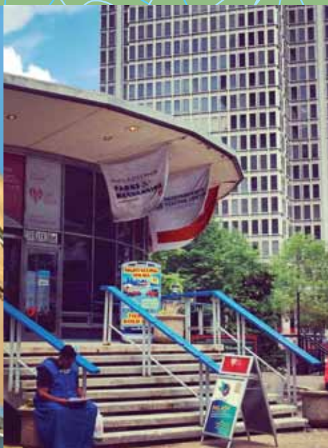
“Saucer” (built 1959-61) and behind, the Municipal Services Building (built 1962-65)

Be a modernism detective! Mid-century architecture is all around us – from the fire station to the flower shop, sometimes period construction and sometimes old buildings that were modernized with a new façade or signage. We’re only beginning to appreciate modernism, as our perception of what is “historic” catches up with our personal history timelines. Keep your eyes open and see what you can find around you. Share #PreservationPA-MCM