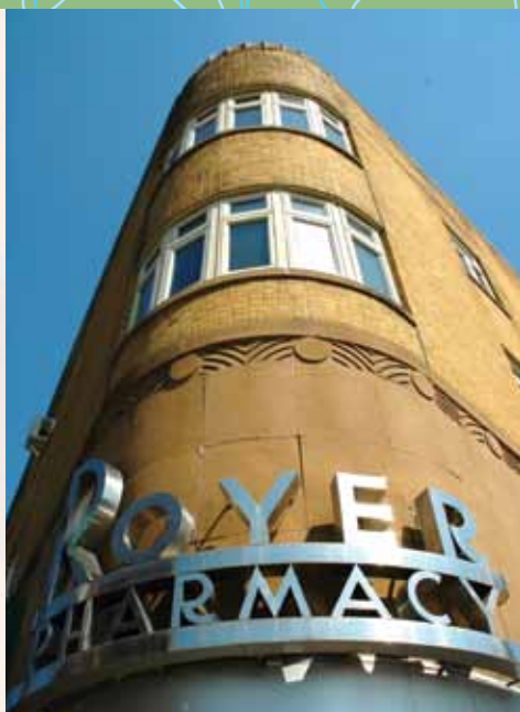
The Royer Building, Ephrata • 1939