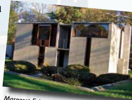
Margaret Esherick House, built 1959-62, Louis Kahn, architect

John D. Rockefeller began restoration of Williamsburg in Virginia in 1929. In 1931, construction began on the Philadelphia Savings Fund Society (PSFS) building in Philadelphia, the country's first International Style skyscraper. (This National Historic Landmark is now a Loews Hotel.)