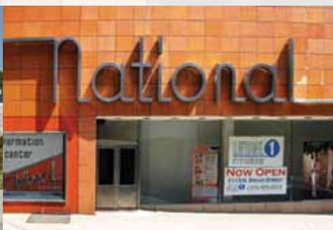
The National Products Building, Philadelphia • 1957