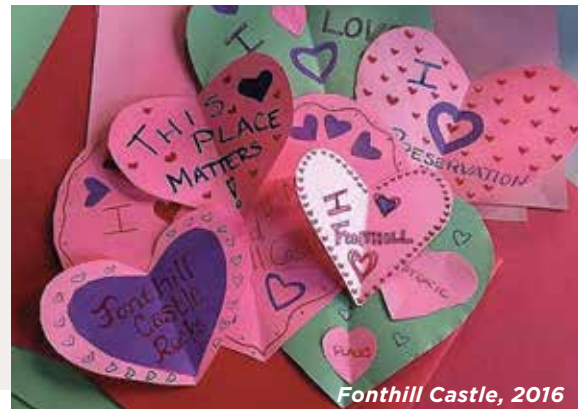
Fonthill Castle, 2016