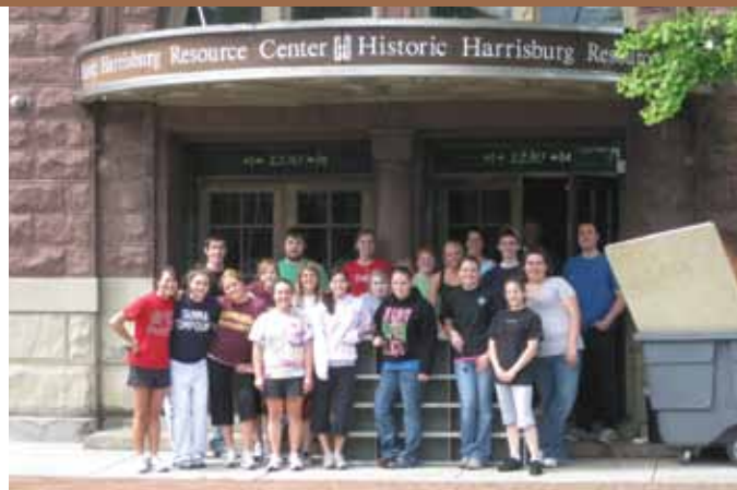
Historic Harrisburg Association, Dauphin County

for outstanding historic preservation efforts at the local level