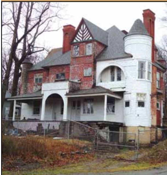
BRAEMAR COTTAGE, Cresson, Pa.

Eminent domain requires the government entity to follow proper procedural requirements; if they do not follow these requirements, the acquisition can be challenged and stopped. For more information about eminent domain in your area, please contact a qualified attorney.