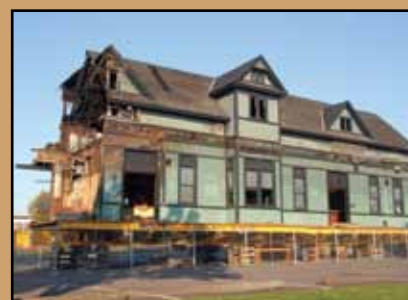
Partially demolished Depot on cribbing awaiting its new foundation. Cover photo of Pennsylvania At Risk in 2010.