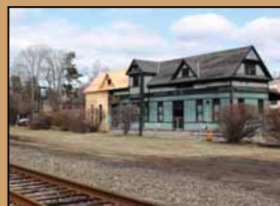
Dansbury Depot in its new location, with reconstructed wing.