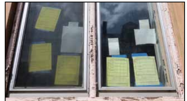
This historic downtown building in Easton, Pa. is being rehabilitated, with building permits displayed proudly.

Remember, for historic buildings, alternative solutions may be possible. Almost every code contains a provision allowing compliance by alternative means and materials. However, acceptance of such alternative solutions and materials is at the discretion of the BCO. To get approval, it is the responsibility of the property owner and/or project designer to demonstrate to the code official that the proposed solutions are necessary to preserve important historic features and that they meet the intent of the code.