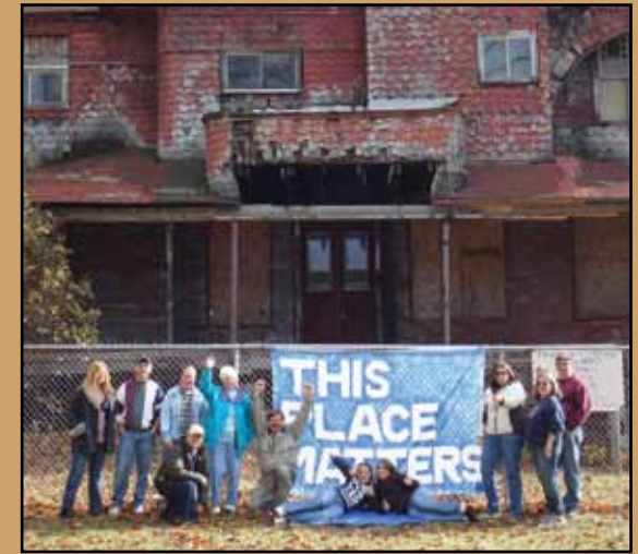
A group of volunteers gives themselves the thumbs up, celebrating their success in raising $10,000 in 24 hours to post bond for an injunction to prevent demolition of the B.F. Jones Cottage in Cresson, Pa.

There are many battles in every preservation war. In order to maintain the energy and optimism of your volunteers and partners, and to communicate your successes to the public, it is important that you take time to recognize your victories along the way.