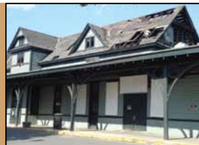
Dansbury Depot after the fire, before acquisition by the developer.

Projects like this are extremely difficult; had the community mobilized to acquire the property sooner, they would have had a much easier time and saved a substantial amount of money.